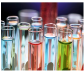
Summer Research Program 2016