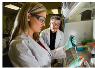
Summer Sabbatical 2015