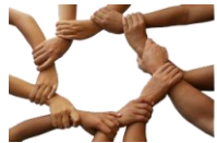
First Face-to-Face Meeting