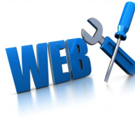
BUILDing SCHOLARS Website