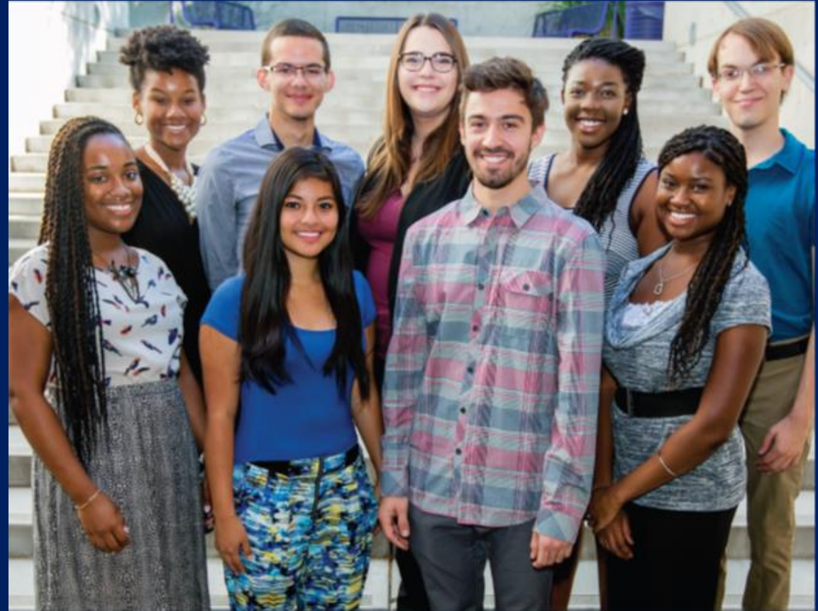
Summer 2015 Cohort